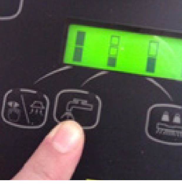
2 Check if you have the right water setting